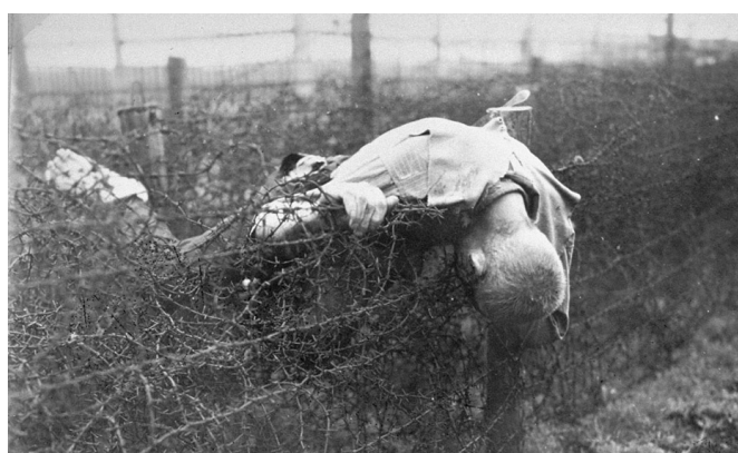
Buchenwald Lepzig – Thekla, Germany Concentration Camp April, 1945

“The corpse of a prisoner lies on the barbed wire fence in Leipzig-Thekla, a sub-camp of Buchenwald”