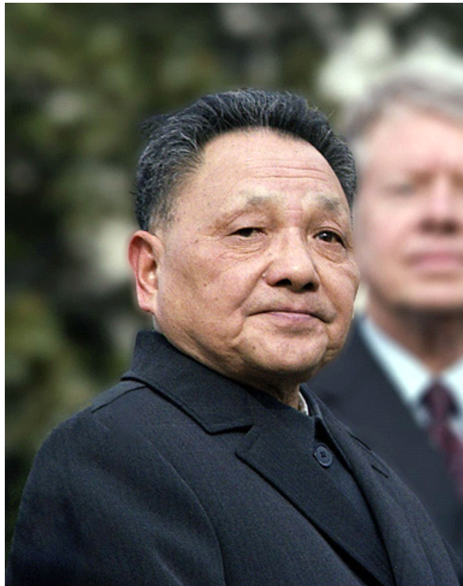
"Deng Xiaoping" by author unknown, part of the US National Archives, hosted by Wikimedia Commons, USA in the Public Domain

https://commons.wikimedia.org/wiki/File:Deng_Xiaoping_and_Jimmy_Carter_at_the_arrival_ceremony_for_the_Vice_Premier_of_China._-_NARA_-_183157-restored(cropped).jpg